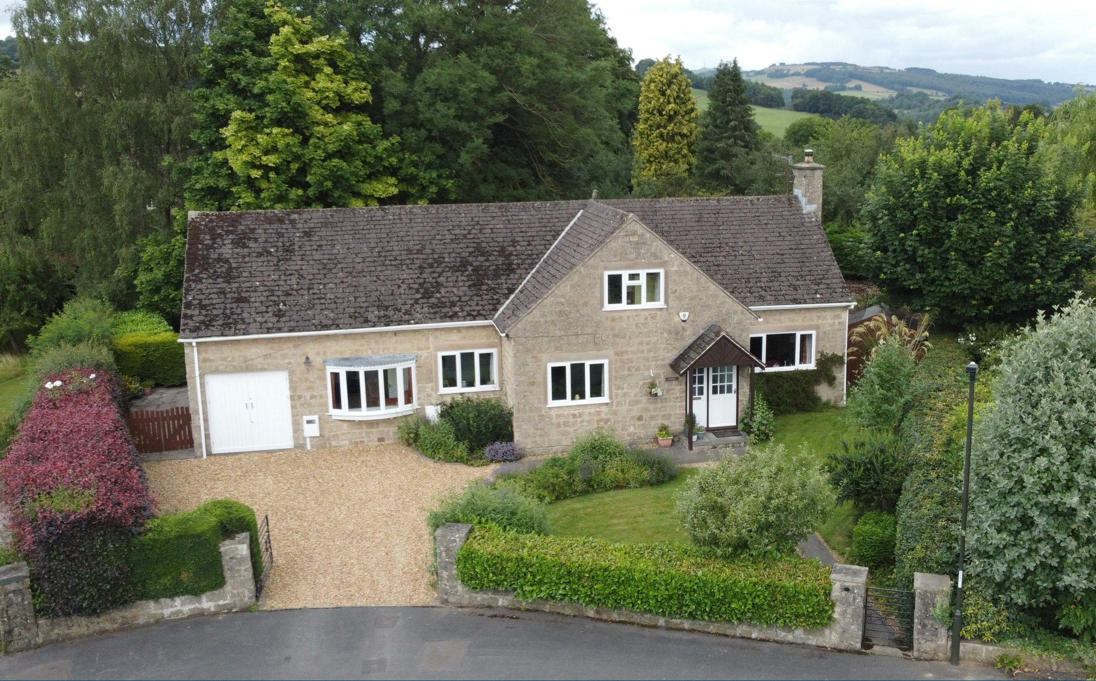
Rodings, 5 White Edge Drive, Baslow, Derbyshire, DE45 1SJ