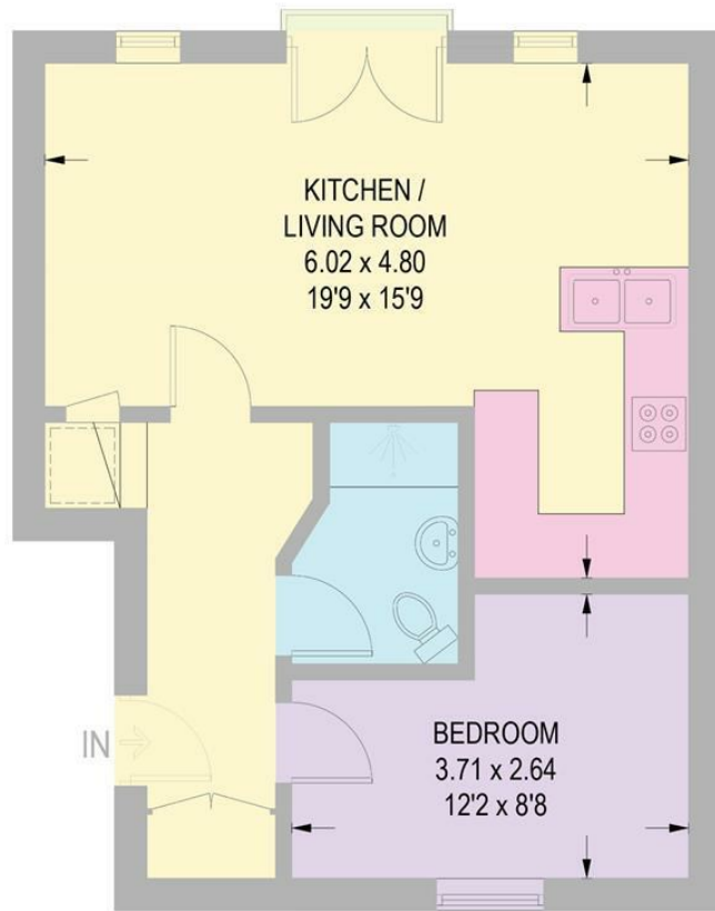
FIRST FLOOR 42.7 SQ M / 460 SQ FT

APPROXIMATE GROSS INTERNAL AREA = 79.4 SQ M / 855 SQ FT (INCLUDING EAVES)