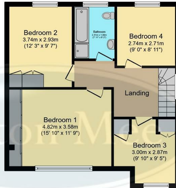
First Floor Floor area 59.1 m 2 (636 sq.ft.)