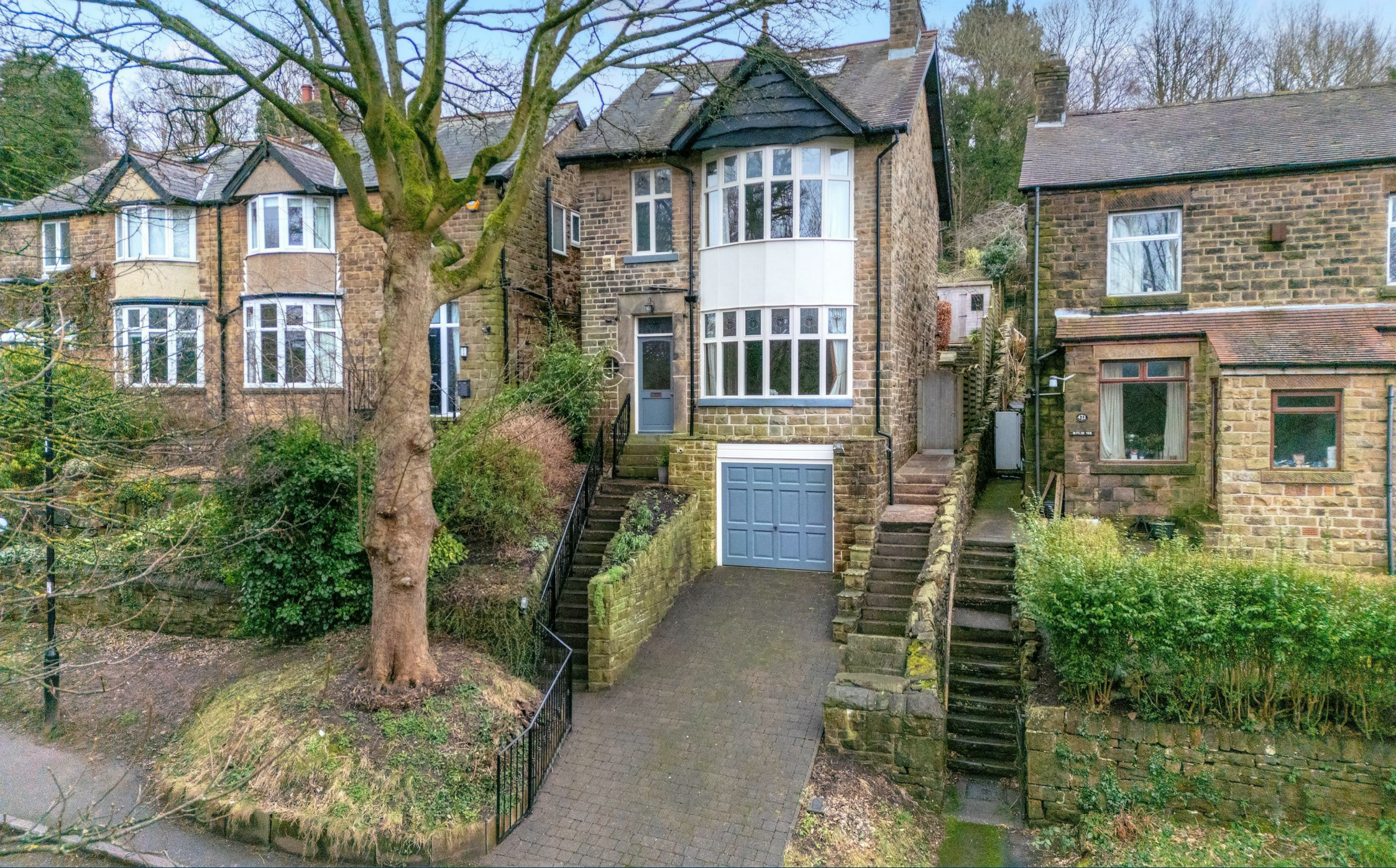
469 Greystones Road, Greystones, Sheffield, S11 7BY