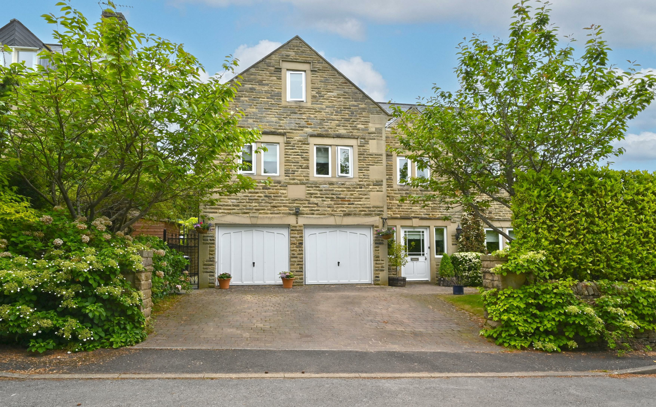
Clifton House, 2 Newfield Place, Dore, Sheffield, S17 3ER