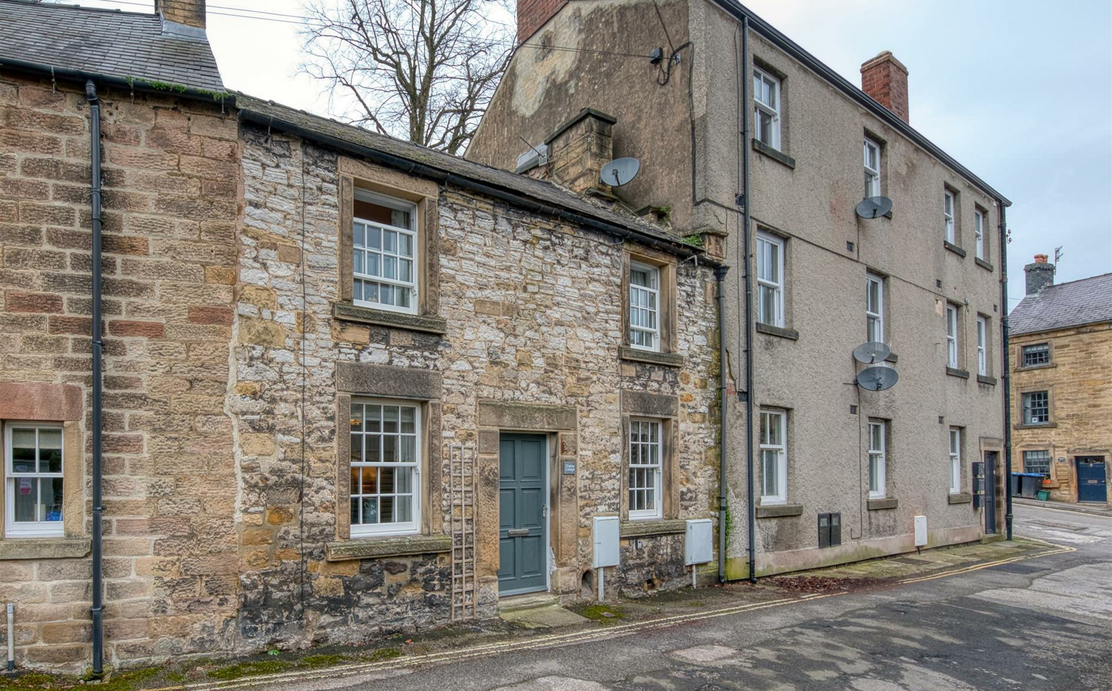
Chalice Cottage, Church Alley, Bakewell, Derbyshire, DE45 1FF