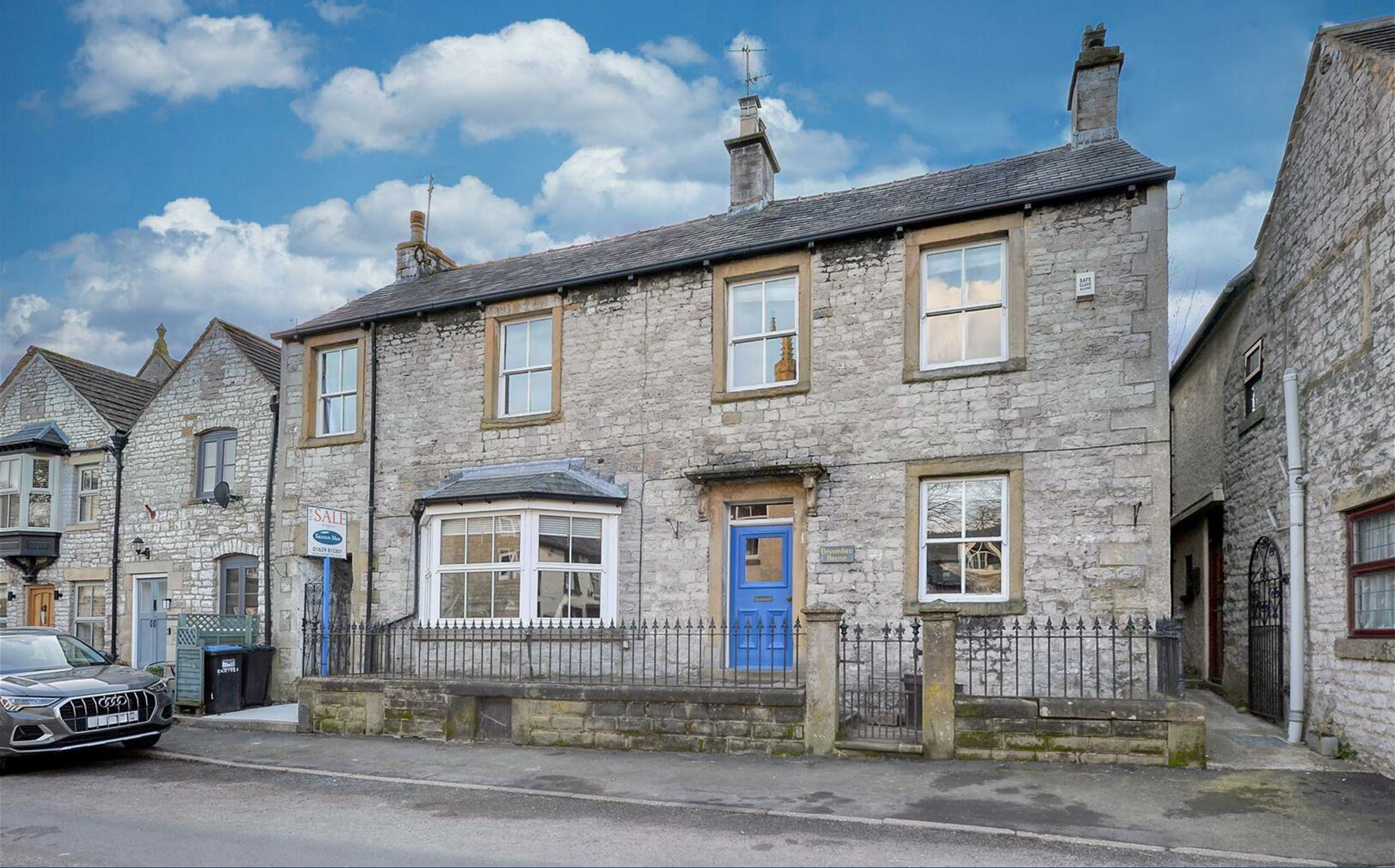
Devonshire House, High Street, Tideswell, Derbyshire, SK17 8LB