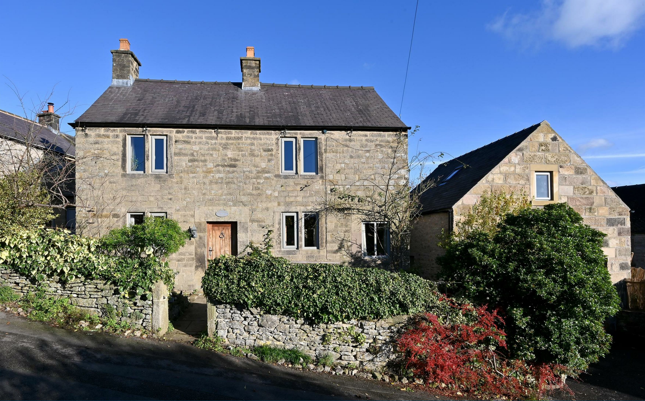
Bedford House, Stoneyside Youlgrave, Derbyshire, DE45 1WH