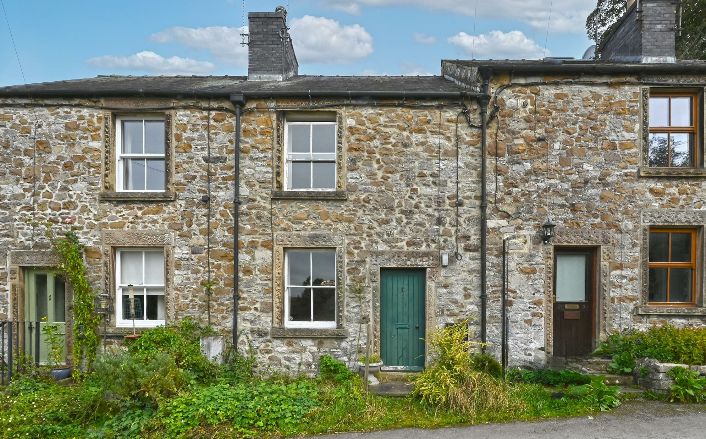
John Bank Cottage, 2 Woodland Terrace John Bank Lane, Ashford-In-The-