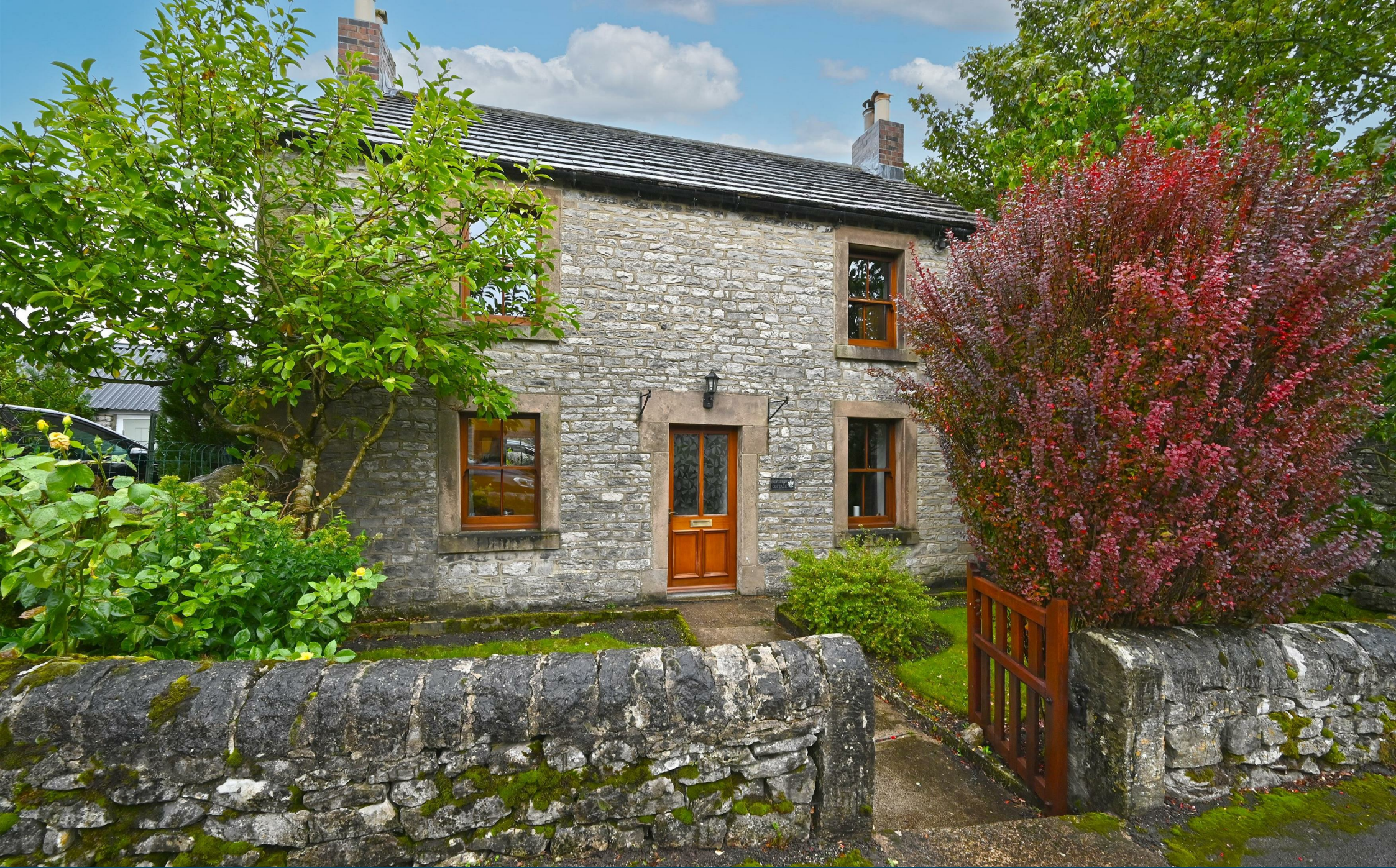
Foxglove Cottage, Main Street, Taddington, Derbyshire, SK17 9UD