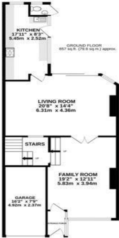
GROUND FLOOR 657 sq. ft. (79.6 sq. m.) approx.