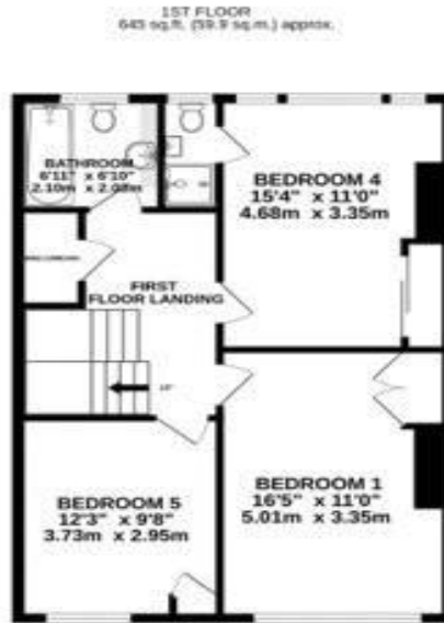
1ST FLOOR 643 sq. ft. (59.7 sq. m.) approx.