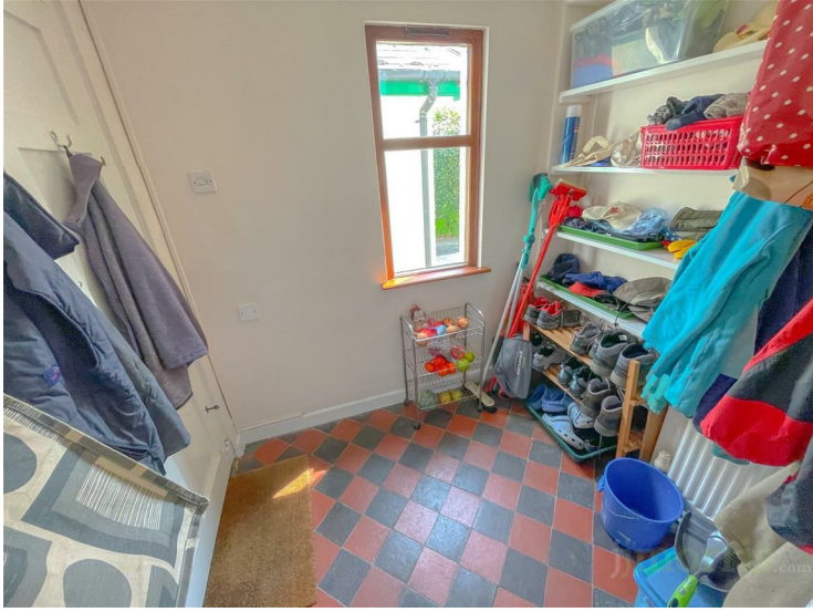
Double glazed window to the side, tiled floor, door to the rear, radiator.