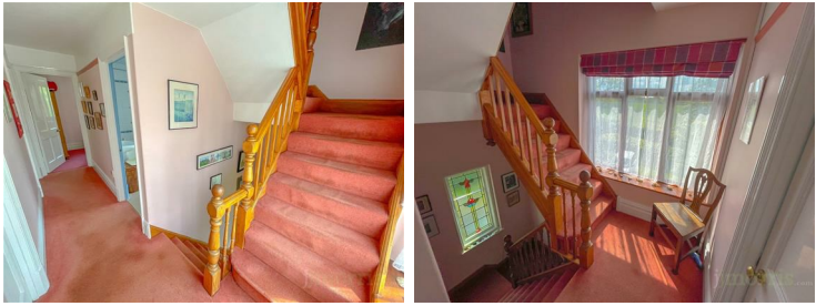
Double glazed window to the side, stairs to second floor, doors to:-