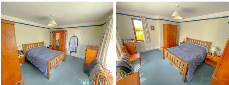
Dual aspect double glazed window, radiator.