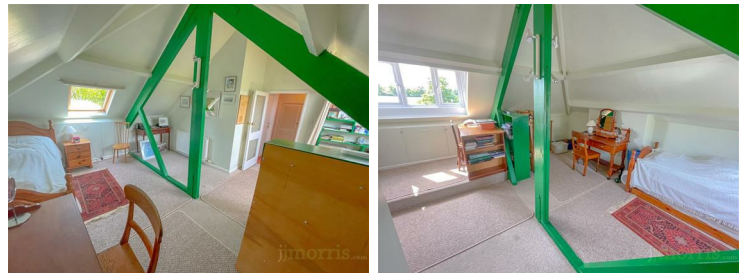
Vaulted ceiling, exposed "A" frame, Upvc double glazed window to the front, Velux roof window, eaves storage, radiator.