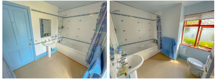
Panel bath with shower and screen over, low flush WC, pedestal hand wash basin, 2 x towel warmers, radiator, double glazed window.