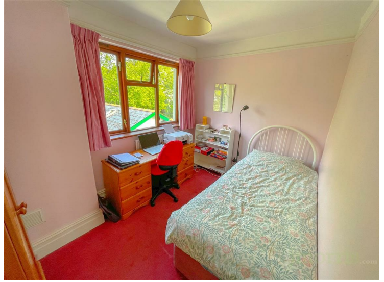
Double glazed window to the rear, radiator.