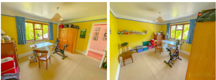
Double glazed window tot he rear, radiator.