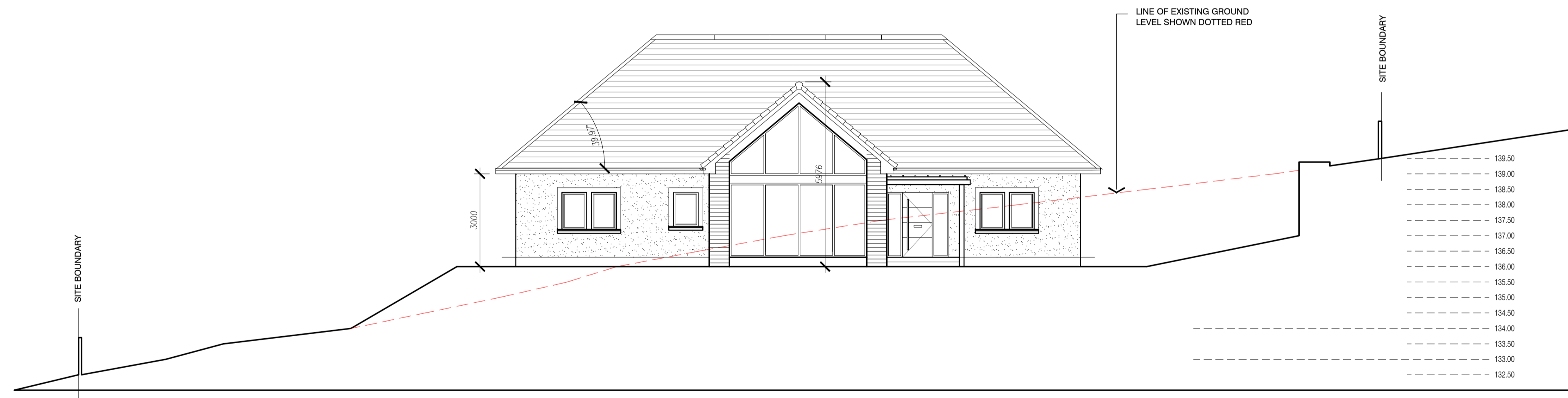
PROPOSED SECTION B-B THROUGH SITE 1:200 SCALE