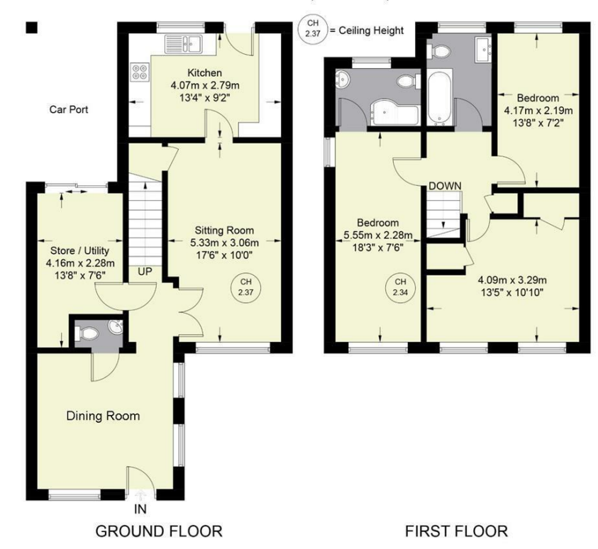
Floor Plan produced for Hursts by Media Arcade ©. Illustration for identification purposes only. Window and door openings are approximate. Whilst every attempt is made to assure accuracy in the preparation of this plan, please check all dimensions, shapes and compass bearings before making any decisions reliant upon them.