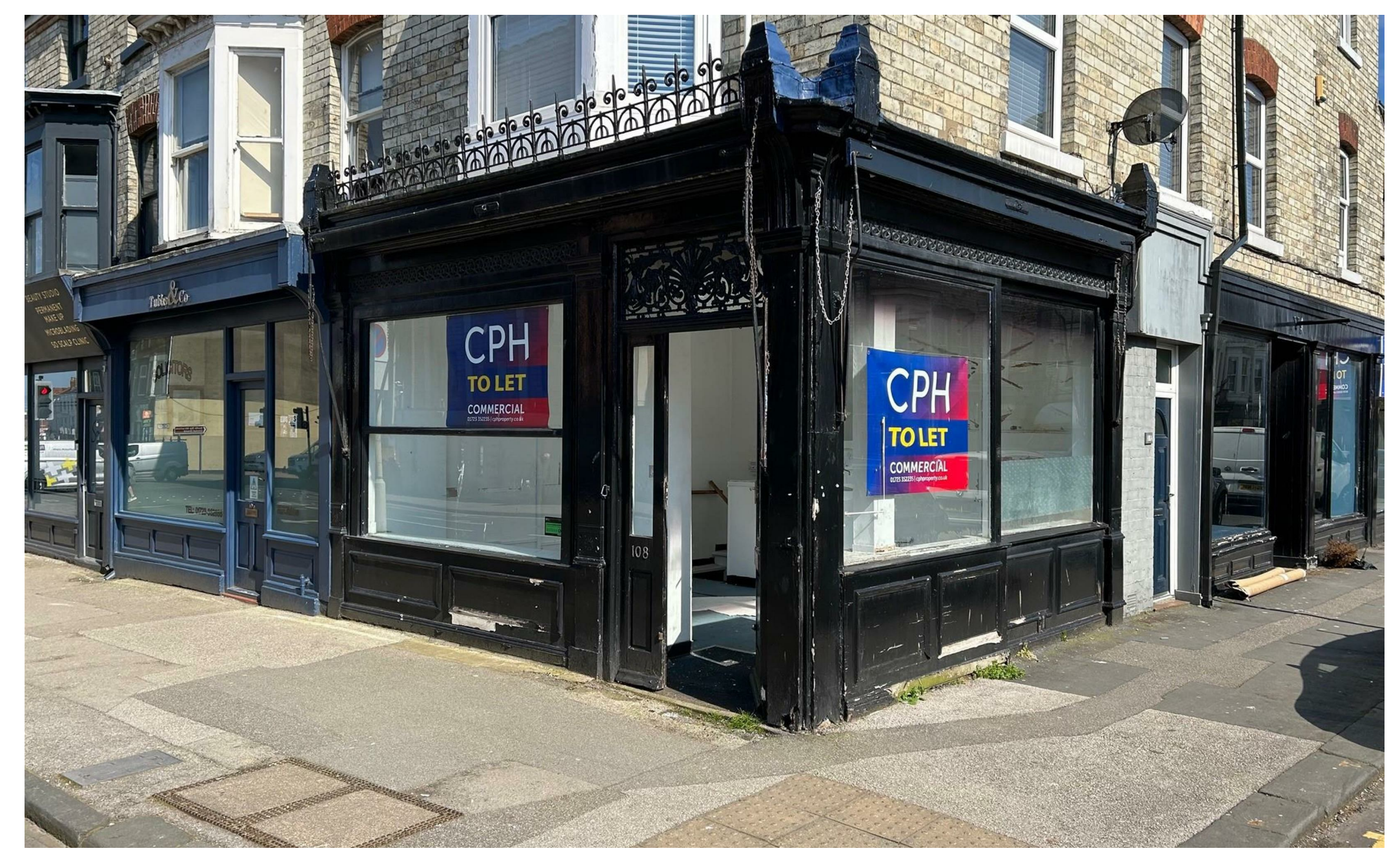
108 Victoria Road, Scarborough YO11 1SL £5,600