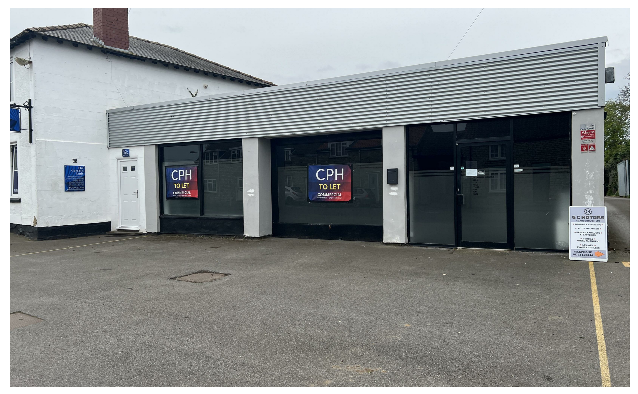
Unit C, 57 Main Street, Seamer, Scarborough YO12 4QD £20,000 Per Annum