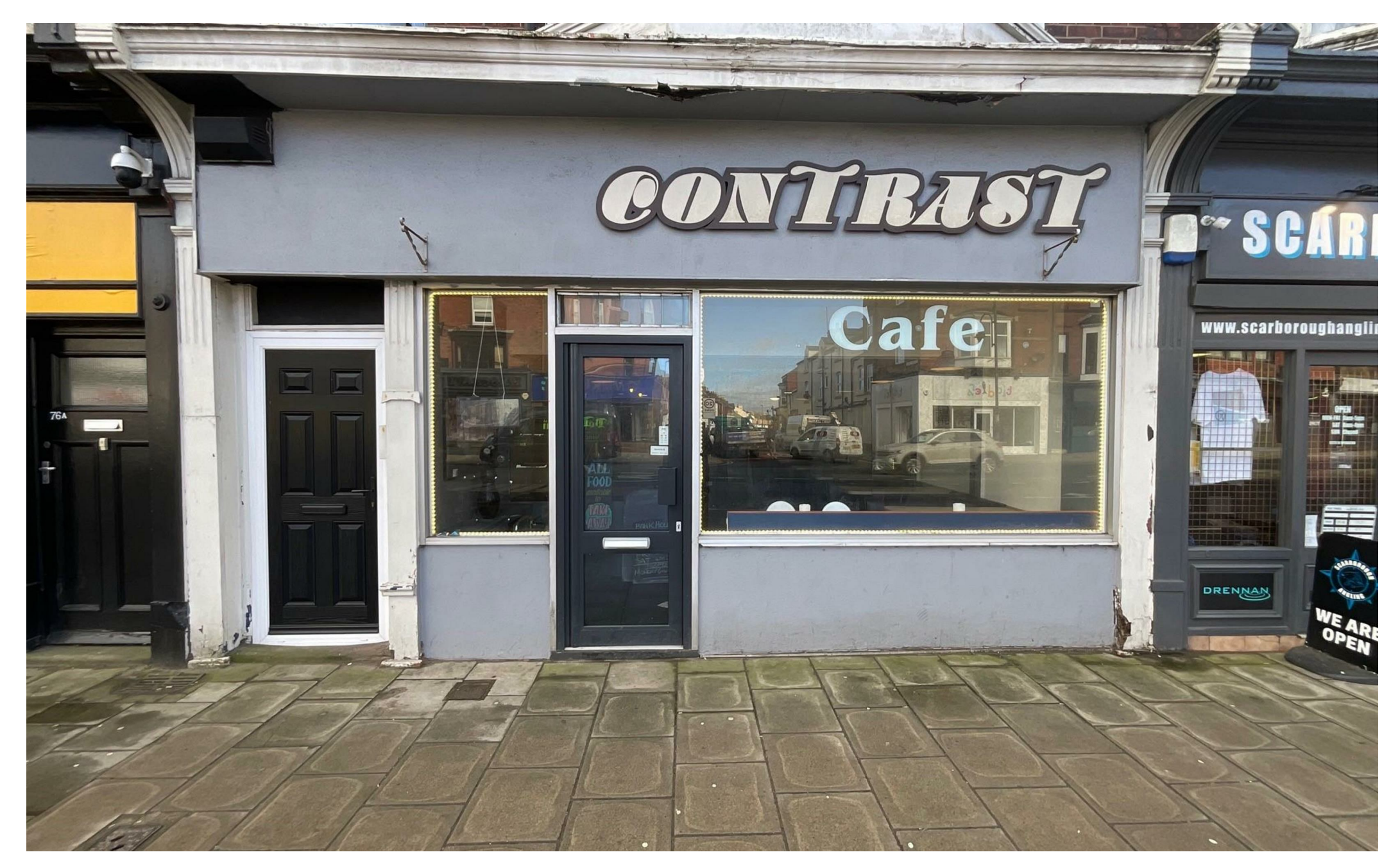
78 Falsgrave Road, Scarborough YO12 5AZ £10,000 Per Annum