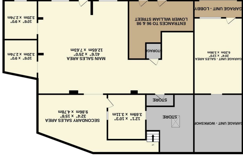
GROUND FLOOR 2351 sq.ft. (218.5 sq.m.) approx.

While every attempt has been made to ensure the accuracy of the diagrams contained therein, measurement of walls, rooms and any other areas are approximate and no responsibility is taken for any error of omission or mis-statement. This plan is the draughtsman's proposal only and should not be used as such by any prospective purchaser. The draughtsman's proposal may be altered without notice and no guarantee is made as to the accuracy of reference to the plan.