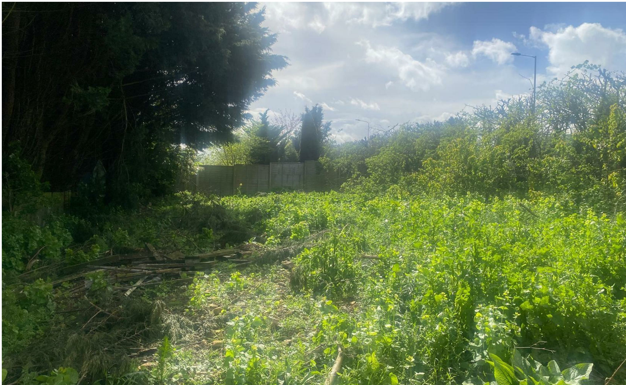
Plot of Land, Scarborough Road, Crossgates, Scarborough, YO12 4JL Price Guide £40,000