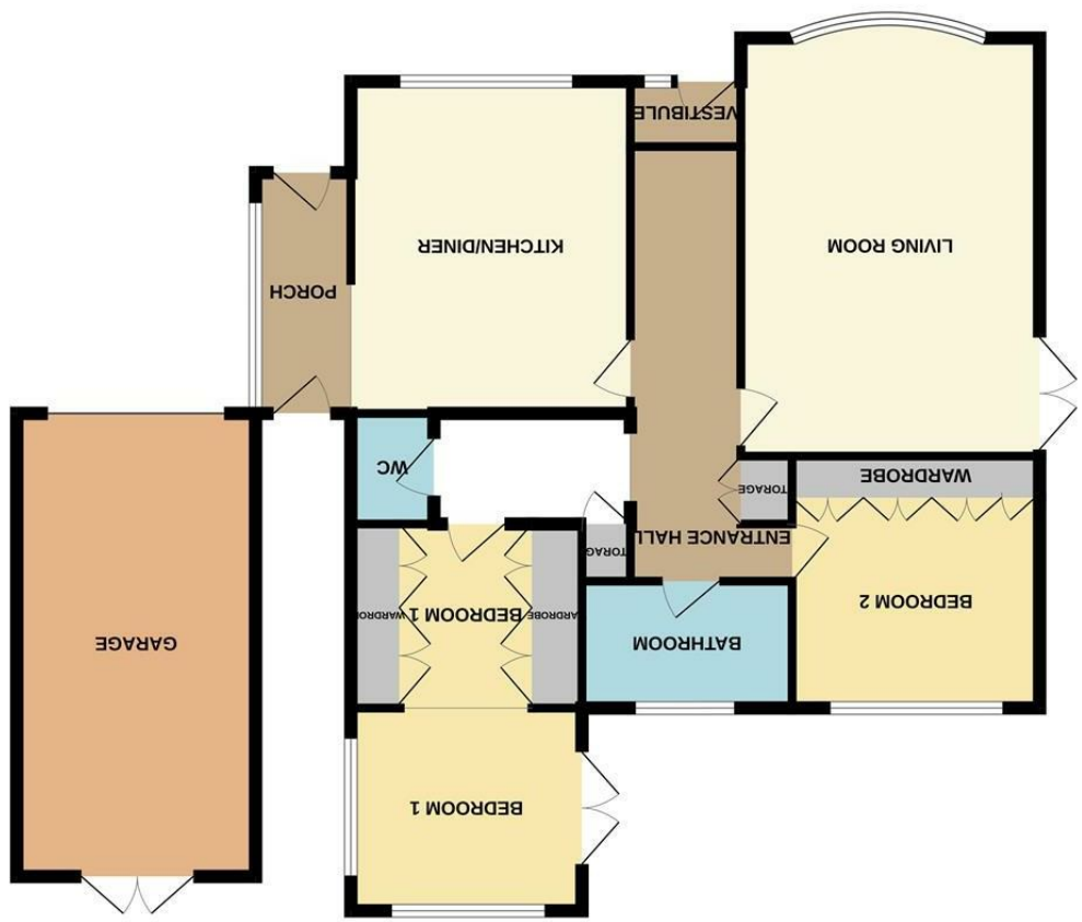
GROUND FLOOR 1173 sq.ft. (109.0 sq.m.) approx.

TOTAL FLOOR AREA: 1173 sq.ft. (109.0 sq.m.) approx.