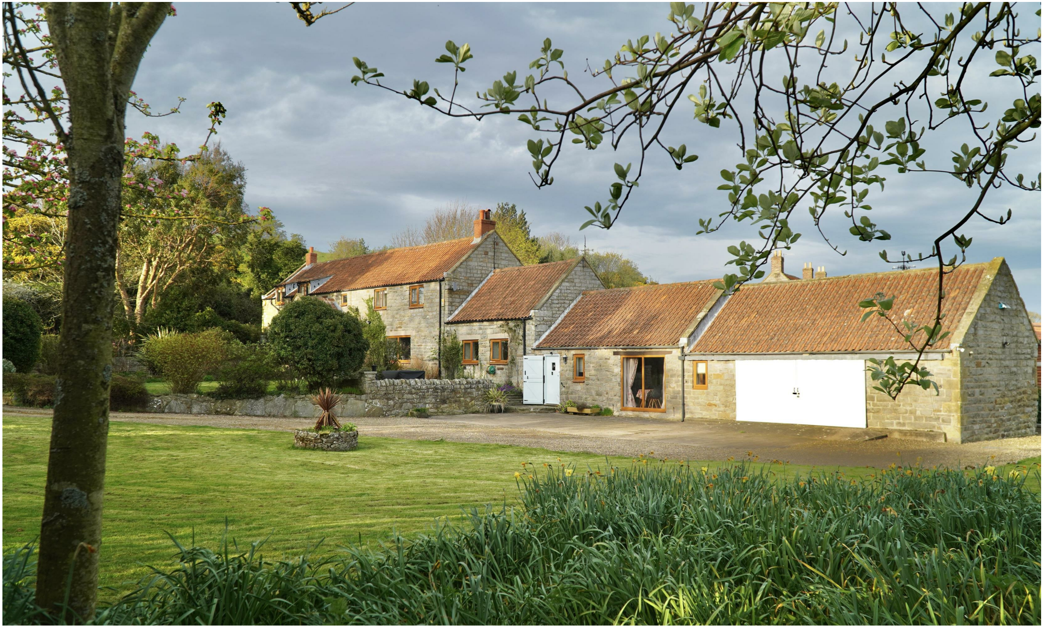
Sycarham Lodge, Hood Lane, Cloughton, Scarborough, Price Guide £795,000