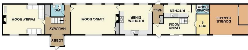
GROUND FLOOR (160.9 sq.m.) approx.