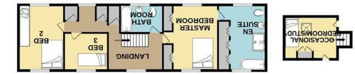
1ST FLOOR (86.5 sq.m.) approx.

TOTAL FLOOR AREA : 263 sq.ft. (247.4 sq.m.) approx.