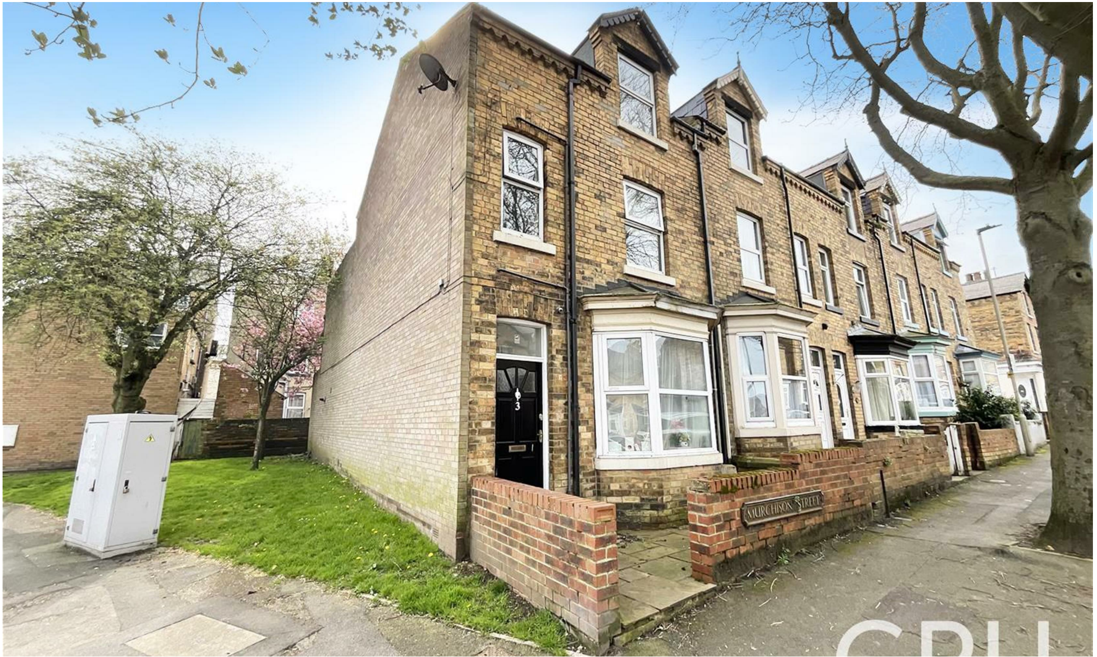
3 Murchison Street, Scarborough YO12 7RN Auction Guide £140,000