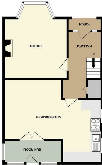
GROUND FLOOR 585 sq ft (54.2 sq m) approx.