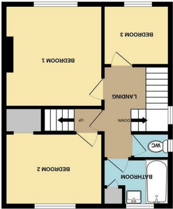
1ST FLOOR 665 sq ft (61.2 sq m) approx.

TOTAL FLOOR AREA: 1175 sq ft (109.1 sq m) approx. Which every attempt has been made to ensure the accuracy of the floorplate contained here, measurements of doors, windows, rooms and any other items are approximate and no responsibility is taken for any error, omission or mis-statement. This plan is for illustrative purposes only and should be used as such by any prospective purchaser. The services, systems and appliances shown have not been tested and no guarantee as to their operability or efficiency can be given. Made with Metropix ©2024