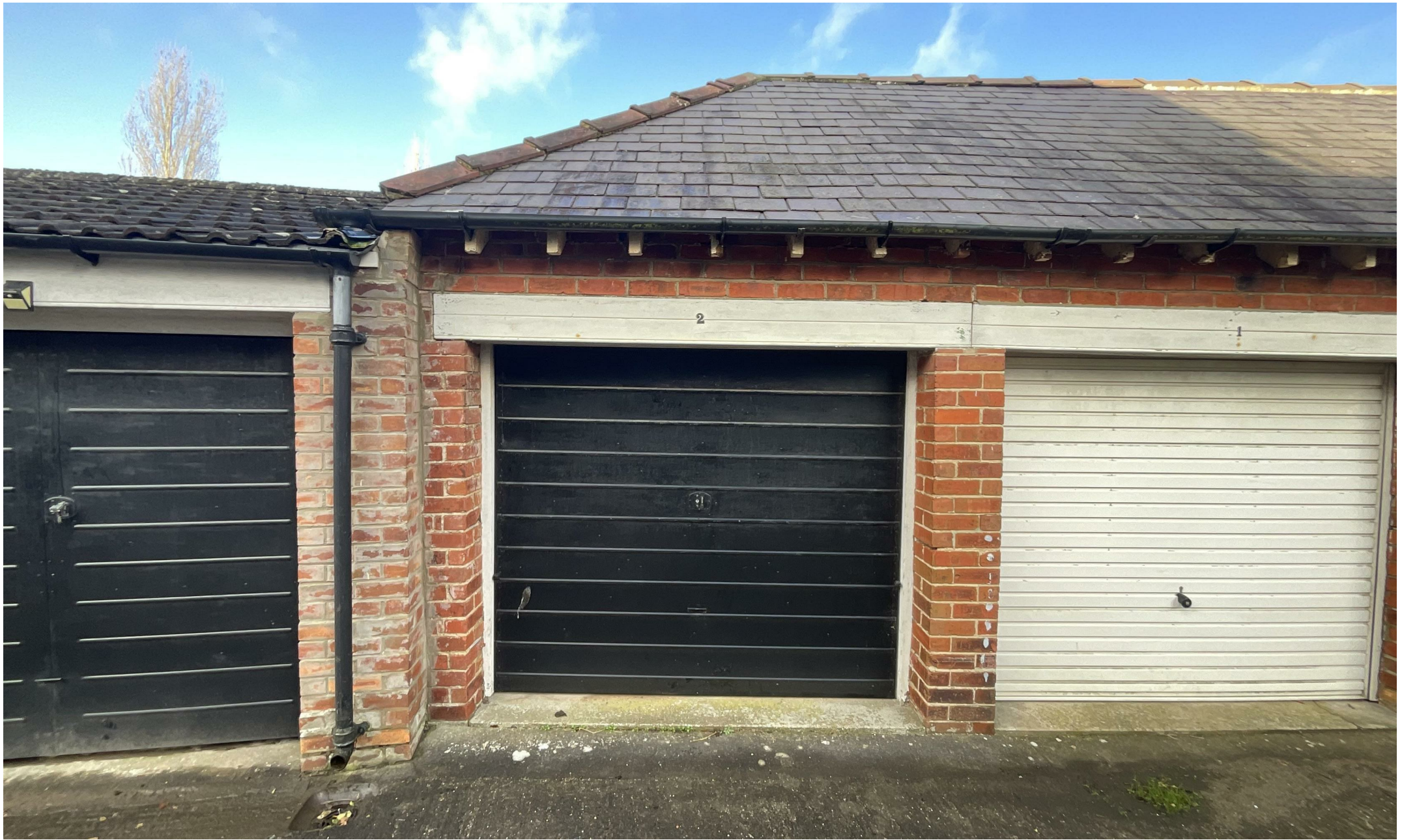
Garage Holbeck Close, Scarborough YO11 2XW Auction Guide £13,500