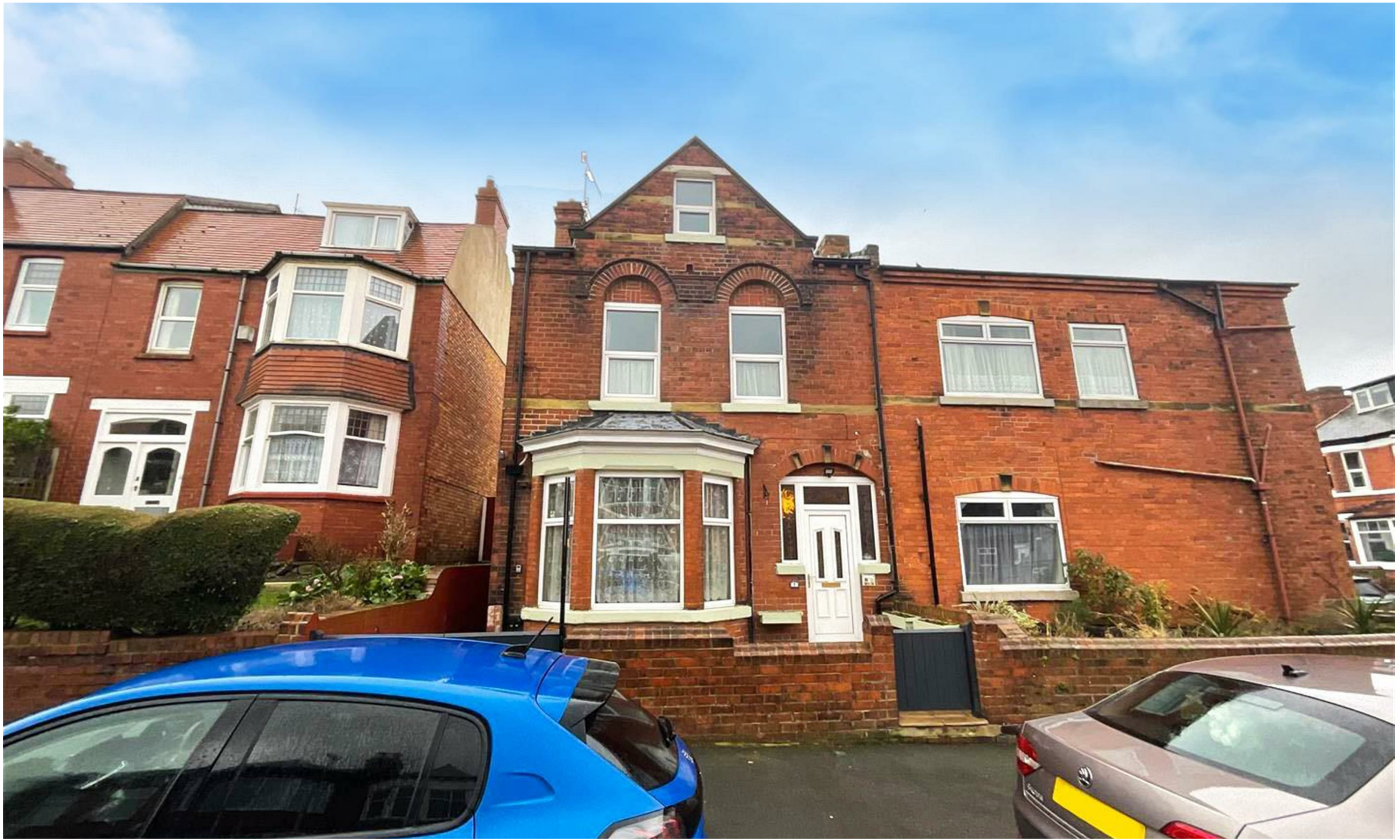
1 Woodall Avenue, Scarborough YO12 7TH Guide Price £260,000