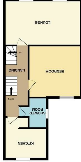
1ST FLOOR 545 sq. ft. (50.6 sq.m.) approx.