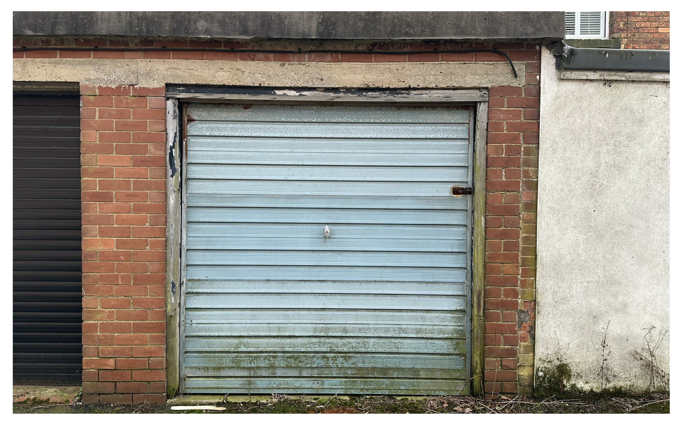
Garage Belvedere Road, Scarborough YO11 2UU Price Guide £20,000