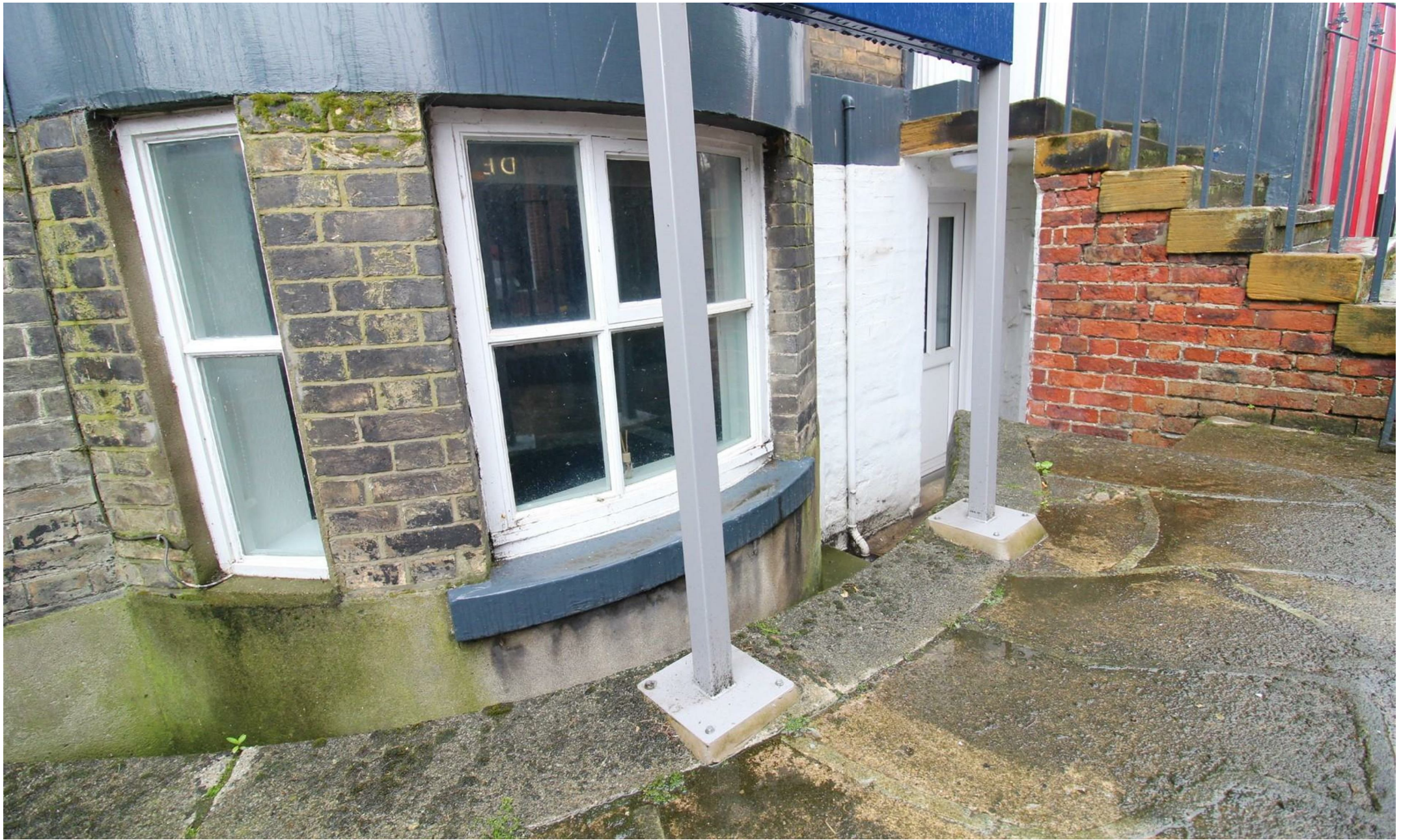
Basement Flat 15 York Place, Scarborough YO11 2NP £500 PCM