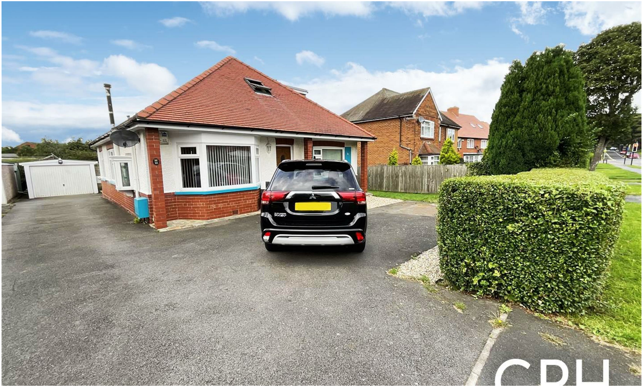
10 Throxenby Lane, Scarborough YO12 5HW Price Guide £358,000