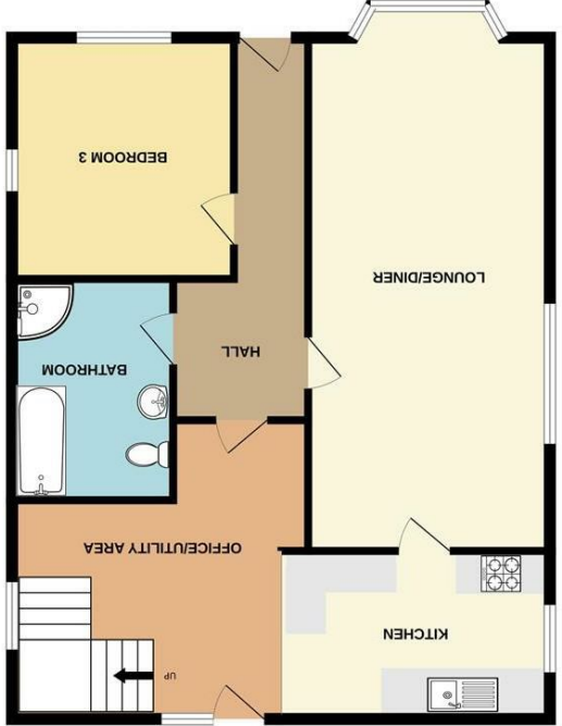
GROUND FLOOR 884 sq.ft. (82.1 sq.m.) approx.

TOTAL FLOOR AREA: 1445 sq.ft. (134.2 sq.m.) approx. Whilst every attempt has been made to ensure the accuracy of the floorplan contained here, measurements of doors, windows, rooms and other items are approximate and no responsibility is taken for any variation or mis-statement. This plan is for illustrative purposes only and should be used as such by any prospective purchaser. The services, systems and appliances shown have not been tested and no guarantee as to their operability or efficiency can be given. Made with Metropix ©2023