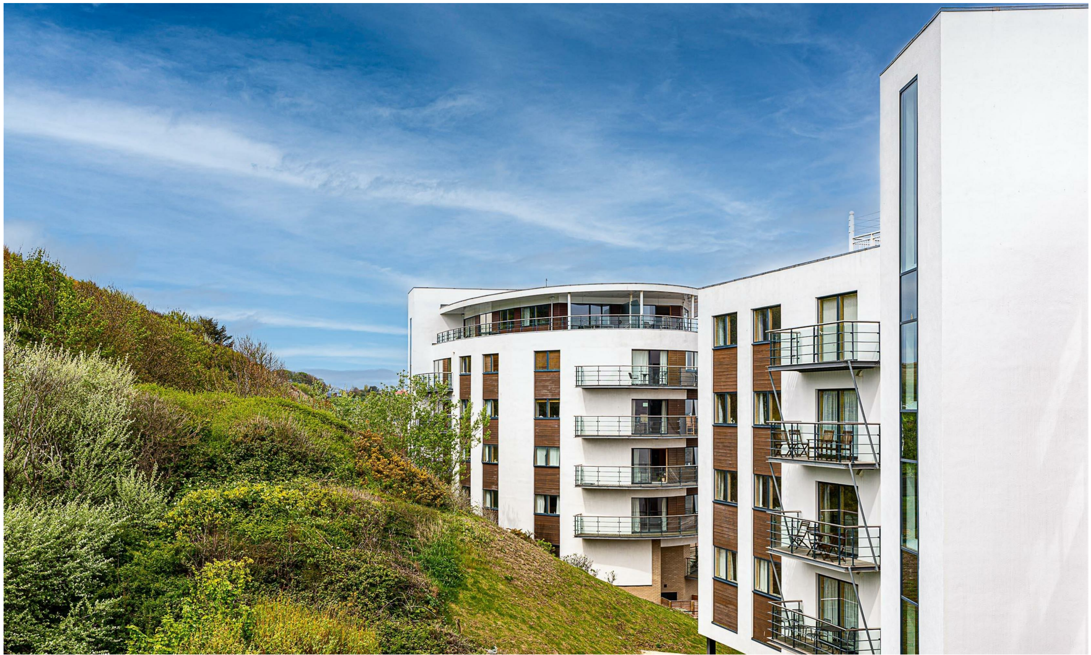
Kepwick House 307 The Sands, Peasholm Gap, Scarborough Guide Price £180,000