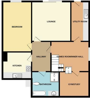
LOWER GROUND FLOOR/ANNEXE 896 sq.ft. (83.3 sq.m.) approx.