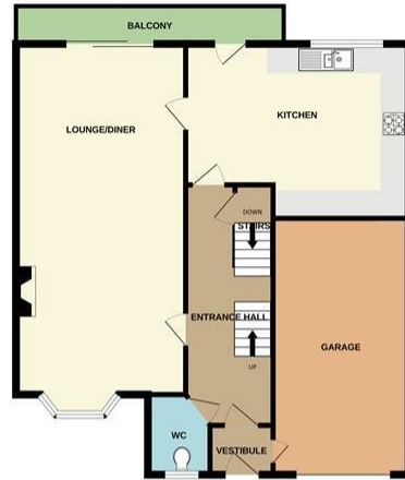
GROUND FLOOR 903 sq.ft. (83.9 sq.m.) approx.