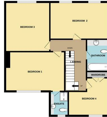
2ND FLOOR 405 sq.ft. (37.7 sq.m.) approx.