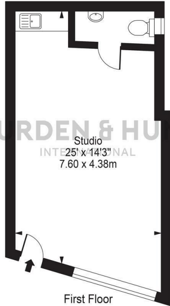
First Floor For Illustration Purposes Only - Not To Scale

Chigwell Road Approx. Gross Internal Area 365 Sq Ft - 33.88 Sq M