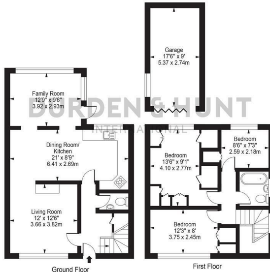
For Illustration Purposes Only - Not To Scale

Soames Mead Approx. Total Internal Area 1221 Sq Ft - 113.41 Sq M (Including Garage) Approx. Gross Internal Area Of Garage 158 Sq Ft - 14.71 Sq M