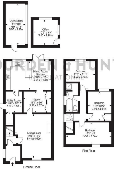
For Illustration Purposes Only - Not To Scale

Holly Cottage Approx. Total Internal Area 1483 Sq Ft - 137.81 Sq M (Excluding Outbuilding/ Storage & Office) Approx. Gross Internal Area 1256 Sq Ft - 116.66 Sq M (Excluding Outbuilding/ Storage & Office) Approx. Gross Internal Area Of Outbuilding/ Storage 128 Sq Ft - 11.91 Sq M Approx. Gross Internal Area Of Office 99 Sq Ft - 9.24 Sq M