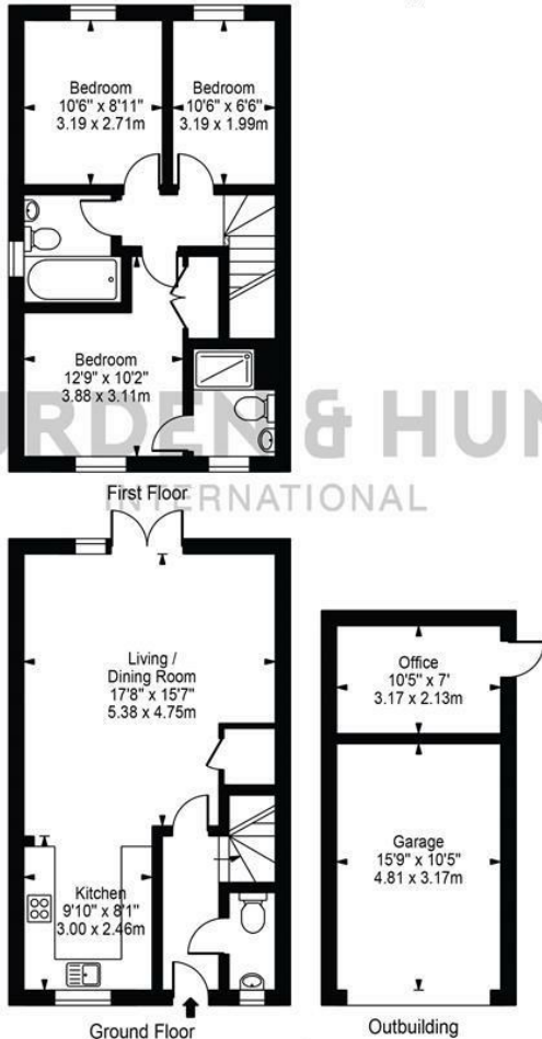
For Illustration Purposes Only - Not To Scale

Approx. Total Internal Area 1141 Sq Ft - 106.02 Sq M (Including Garage & Office) Approx. Gross Internal Area Of Garage 164 Sq Ft - 15.25 Sq M Approx. Gross Internal Area Of Office 73 Sq Ft - 6.75 Sq M