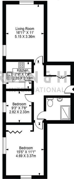
First Floor For Illustration Purposes Only - Not To Scale

St. James Gate, Palmerston Road Approx. Gross Internal Area 683 Sq Ft - 63.44 Sq M