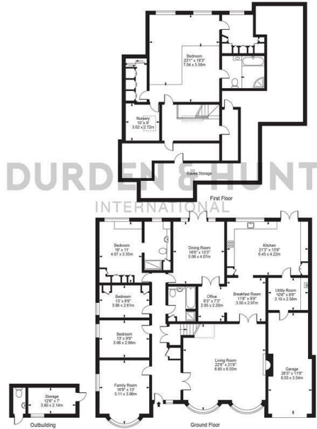
For Illustration Purposes Only - Not To Scale

Thistle Cottage Approx. Total Internal Area 4708 Sq Ft - 437.42 Sq M (Including Outbuilding, Garage & Eaves Storage) Approx. Gross Internal Area 3682 Sq Ft - 342.04 Sq M (Excluding Outbuilding, Garage & Eaves Storage) Approx. Gross Internal Area Of Garage 265 Sq Ft - 26.52 Sq M Approx. Gross Internal Area Of Outbuilding 113 Sq Ft - 10.50 Sq M