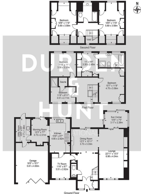
For Illustration Purposes Only - Not To Scale

Barton Close Approx. Gross Internal Area 2848 Sq Ft - 264.59 Sq M (Including Garage & Excluding Void) Approx. Gross Internal Area Of Garage 272 Sq Ft - 25.27 Sq M