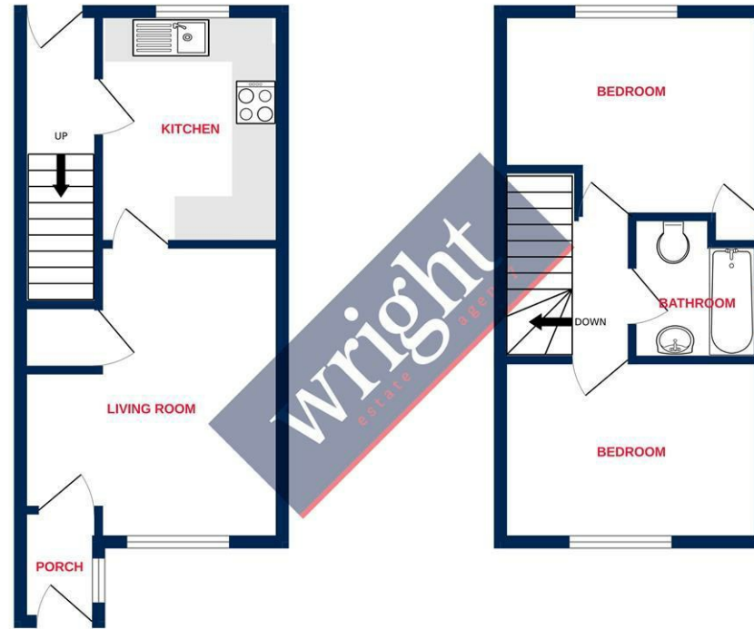
TOTAL FLOOR AREA : 578 sq.ft. (53.7 sq.m.) approx.

Whilst every attempt has been made to ensure the accuracy of the floorplan contained here, measurements of doors, windows, rooms and any other items are approximate and no responsibility is taken for any error, omission or mis-statement. This plan is for illustrative purposes only and should be used as such by any prospective purchaser. The services, systems and appliances shown have not been tested and no guarantee as to their operability or efficiency can be given. Made with Metropix ©2024