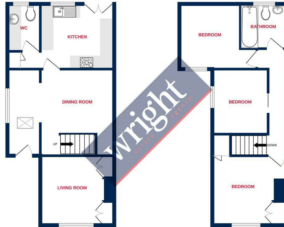
TOTAL FLOOR AREA : 899 sq.ft. (83.5 sq.m.) approx.

Whilst every attempt has been made to ensure the accuracy of the floorplan contained here, measurements of doors, windows, rooms and any other items are approximate and no responsibility is taken for any error, omission or mis-statement. This plan is for illustrative purposes only and should be used as such by any prospective purchaser. The services, systems and appliances shown have not been tested and no guarantee as to their operability or efficiency can be given. Made with Metropix ©2023