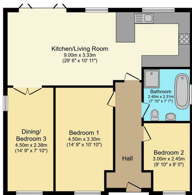
Floor Plan Floor area 74.8 m 2 (805 sq.ft.)